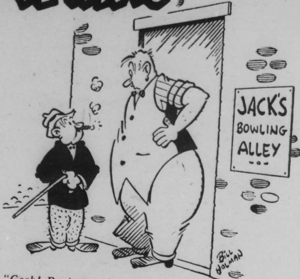
"Gosh! Business is so bad I can't hear a pin drop!"