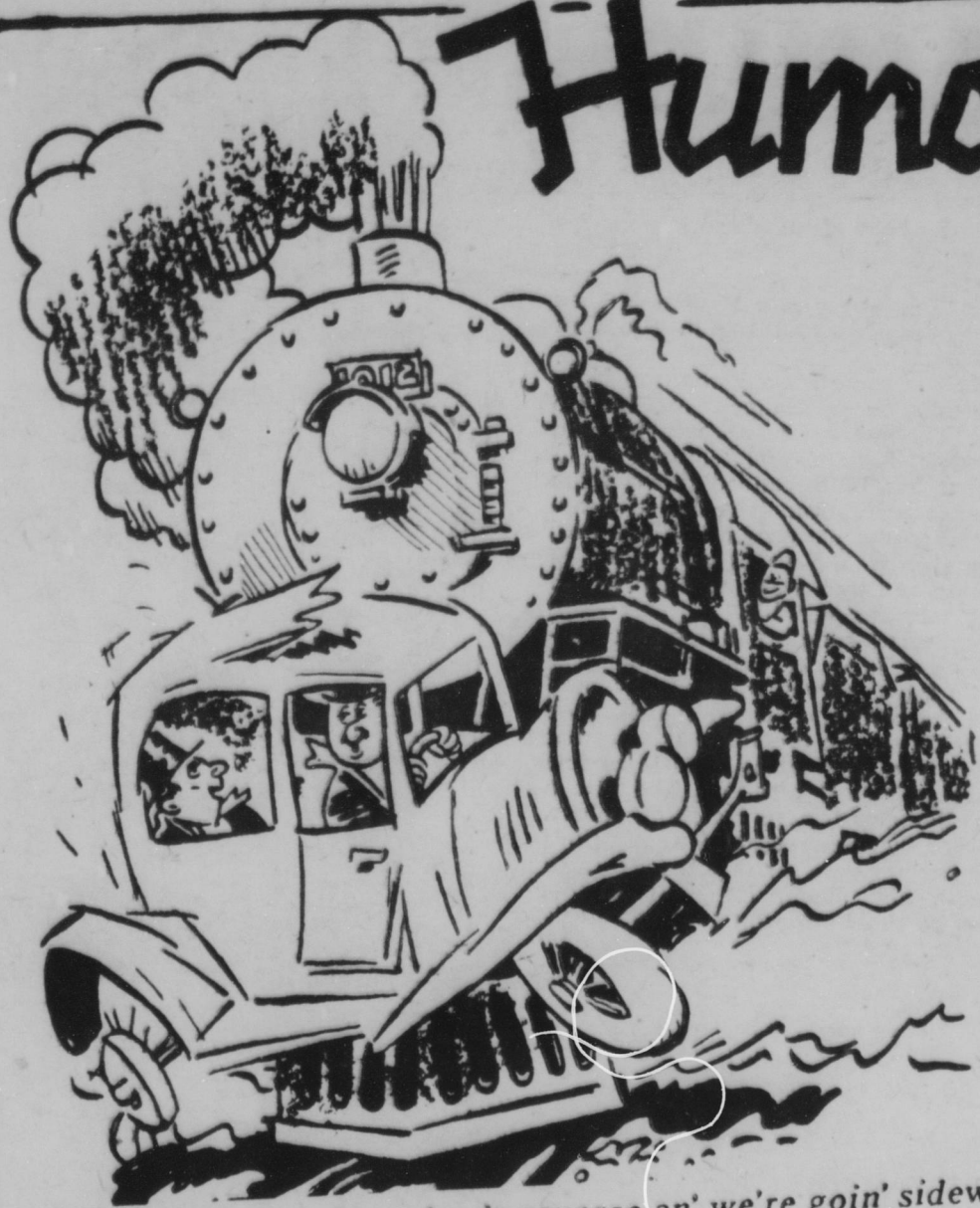
"Thash funny—I got 'er in reverse an' we're goin' sideways!"