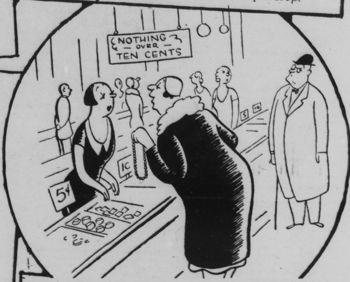
"I'd like to exchange these pearls for a salt shaker!"