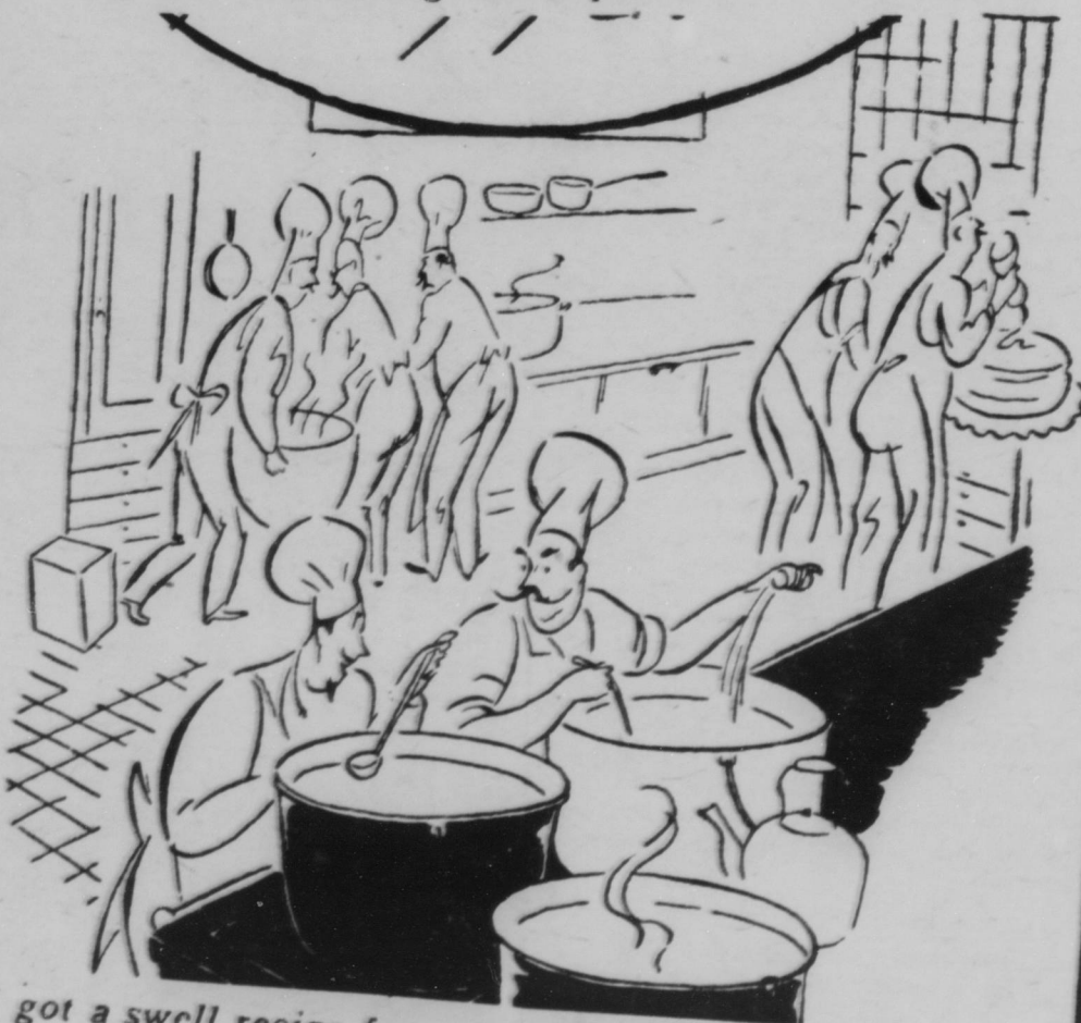
"I got a swell recipe for a dainty dessert—you take 4,000 eggs, 1,000 boxes of strawberries and 738 pints of milk—"