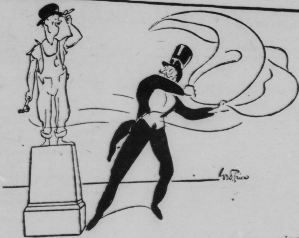
"Th' lady ast me to take her place for a minute."