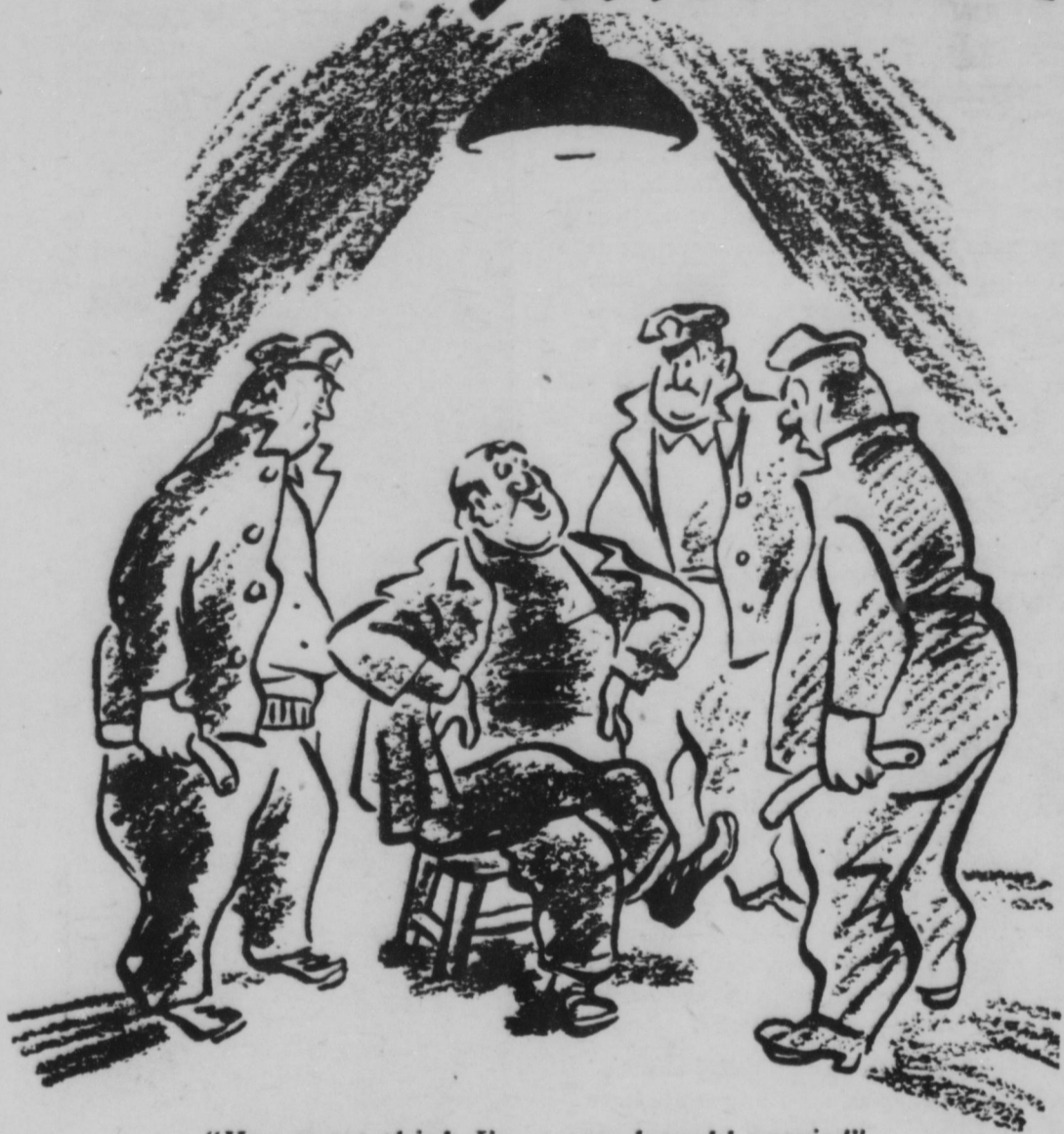
"You must think I'm a regular old gossip!"