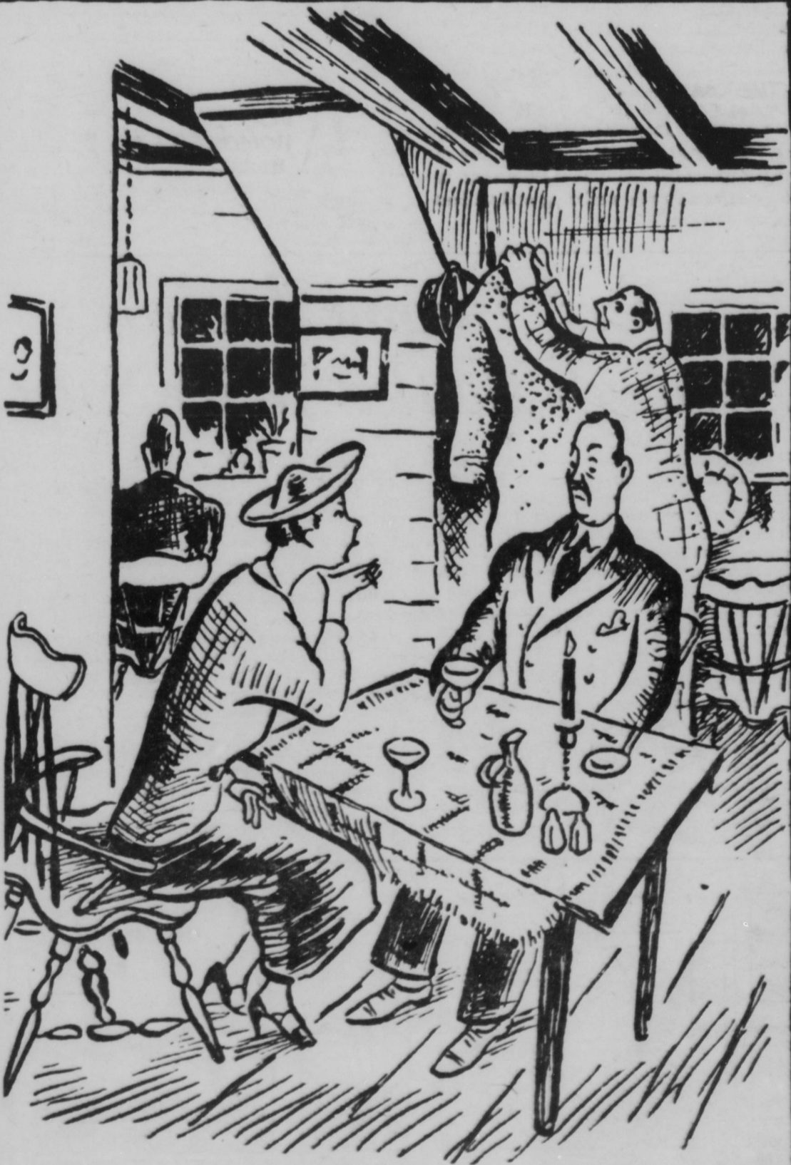
"Don't look now, but that fellow behind you is stealing your topcoat."