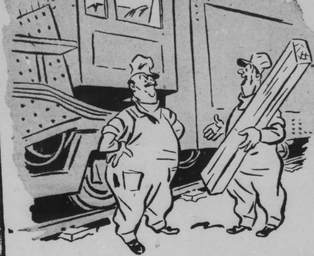
"Look at the new tie the company gave me for my birthday."