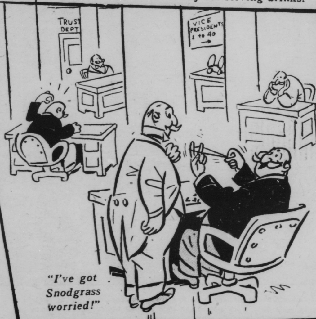
"I've got Snodgrass worried!"