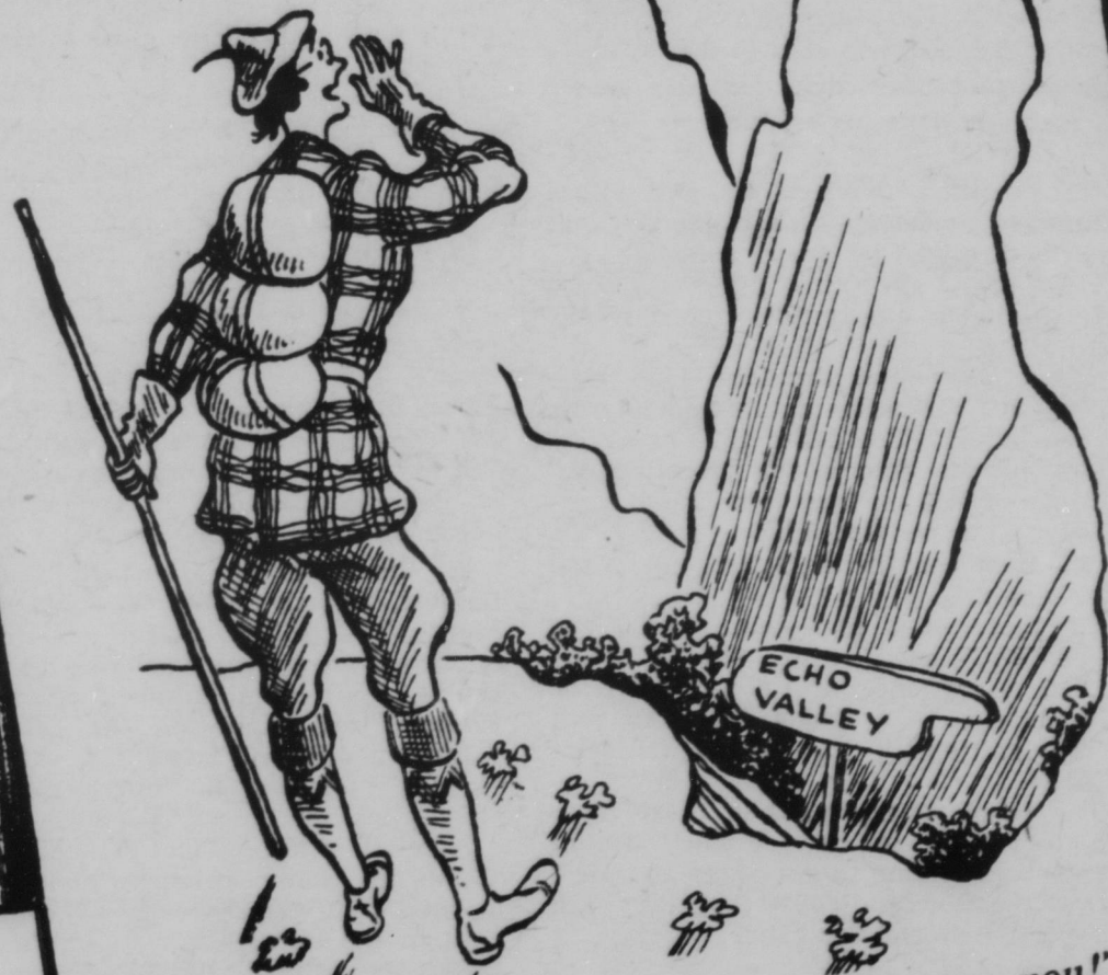
"Yoo-hoo! I love you!"