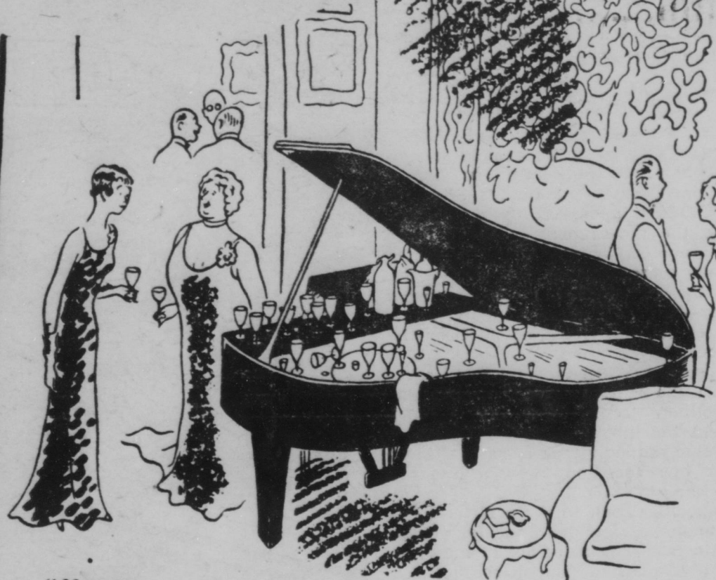
"Neither of us play, but it's lovely for serving drinks."