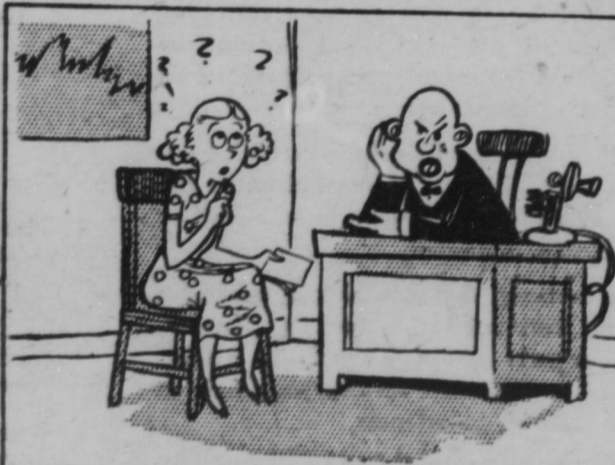
SOME STENOGRAPHERS ARE SO DUMB—THEY THINK SCRATCH PADS ARE USED TO RELIEVE MOSQUITO BITES.