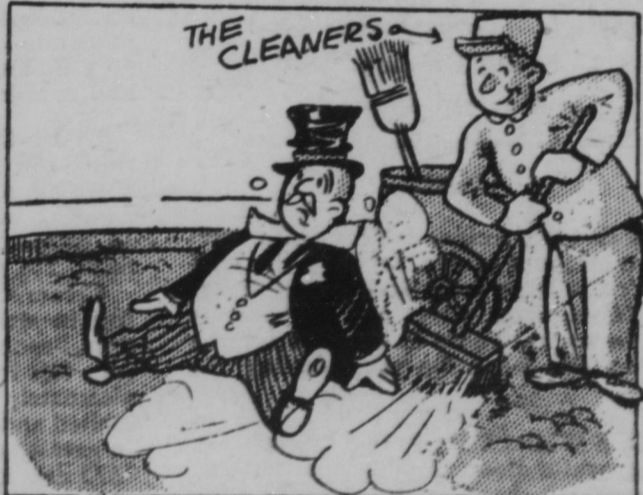
MANY A MAN WHO MAKES INVESTMENTS ON THE 'CURB'—IS NOW IN THE GUTTER.