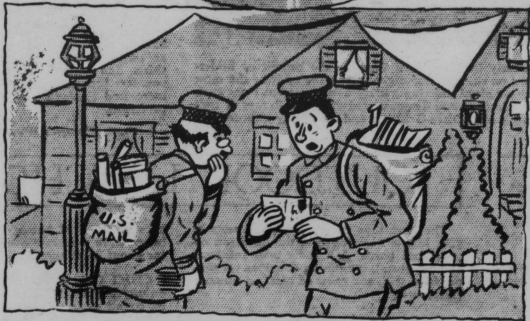
"TOO BAD SHE DOESN'T LIKE HIM—HE WRITES A NICE POST CARD!"