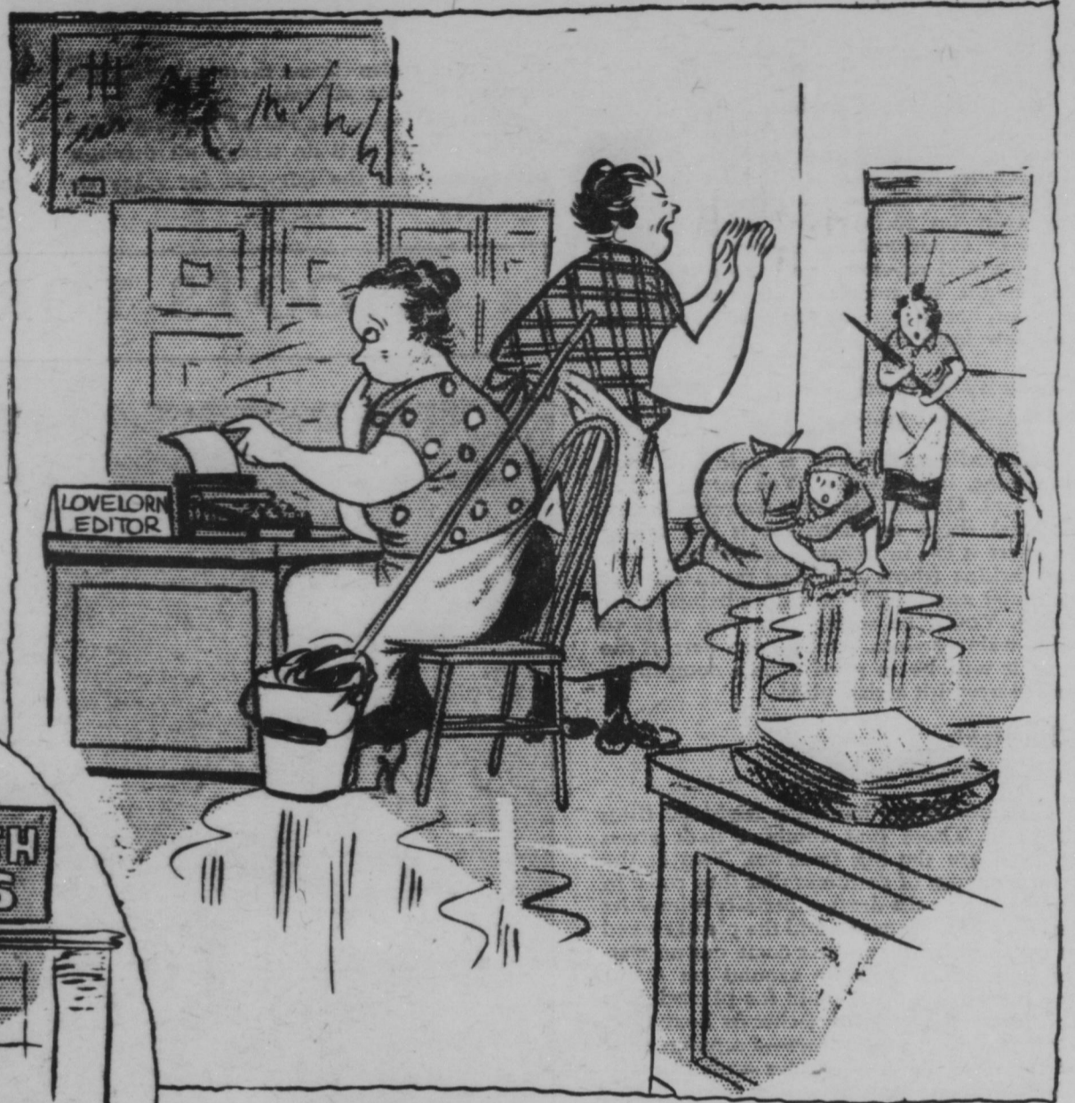
"PIPE DOWN, GIRLS! MRS. SWEENEY IS ANSWERING ANOTHER LETTER!"