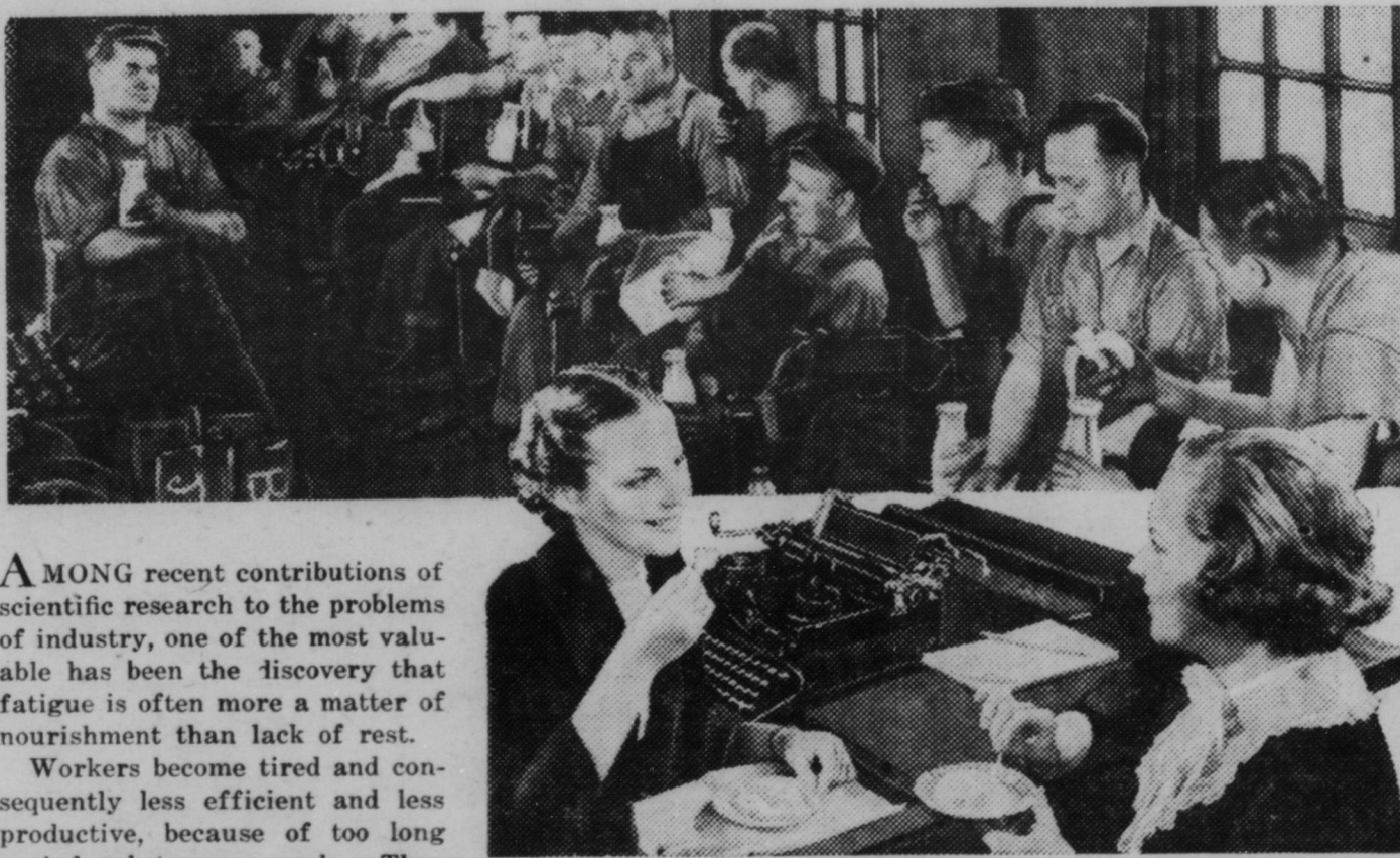
Noted scientists are leading advocates of eating between meals for workers in factories and offices.

AMONG recent contributions of scientific research to the problems of industry, one of the most valuable has been the discovery that fatigue is often more a matter of nourishment than lack of rest.