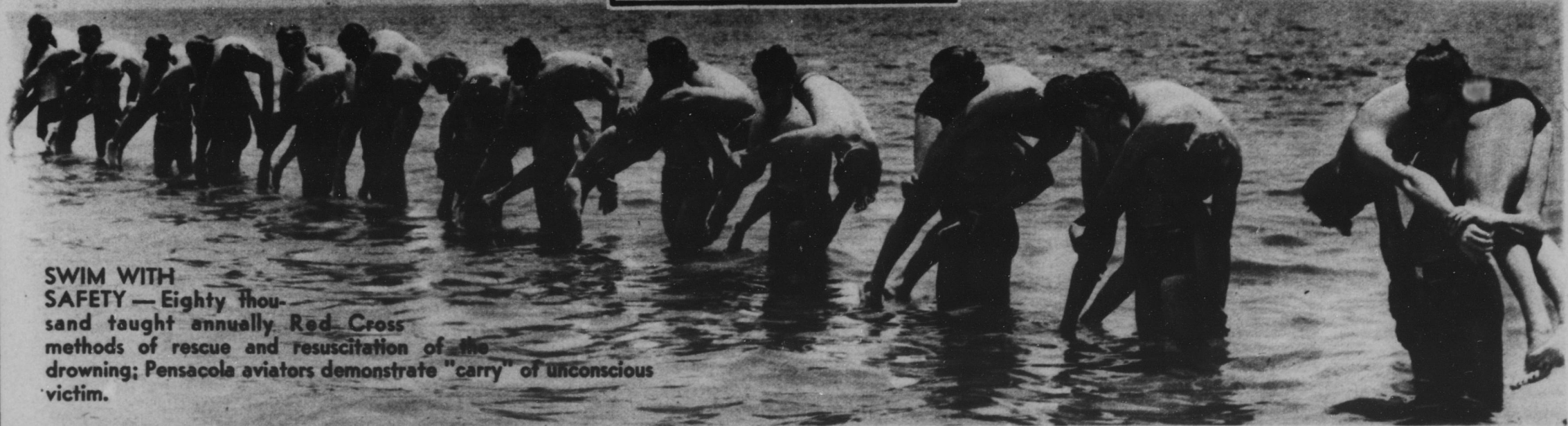
SWIM WITH SAFETY —Eighty thousand taught annually Red Cross methods of rescue and resuscitation of the drowning; Pensacola aviators demonstrate "carry" of unconscious victim.