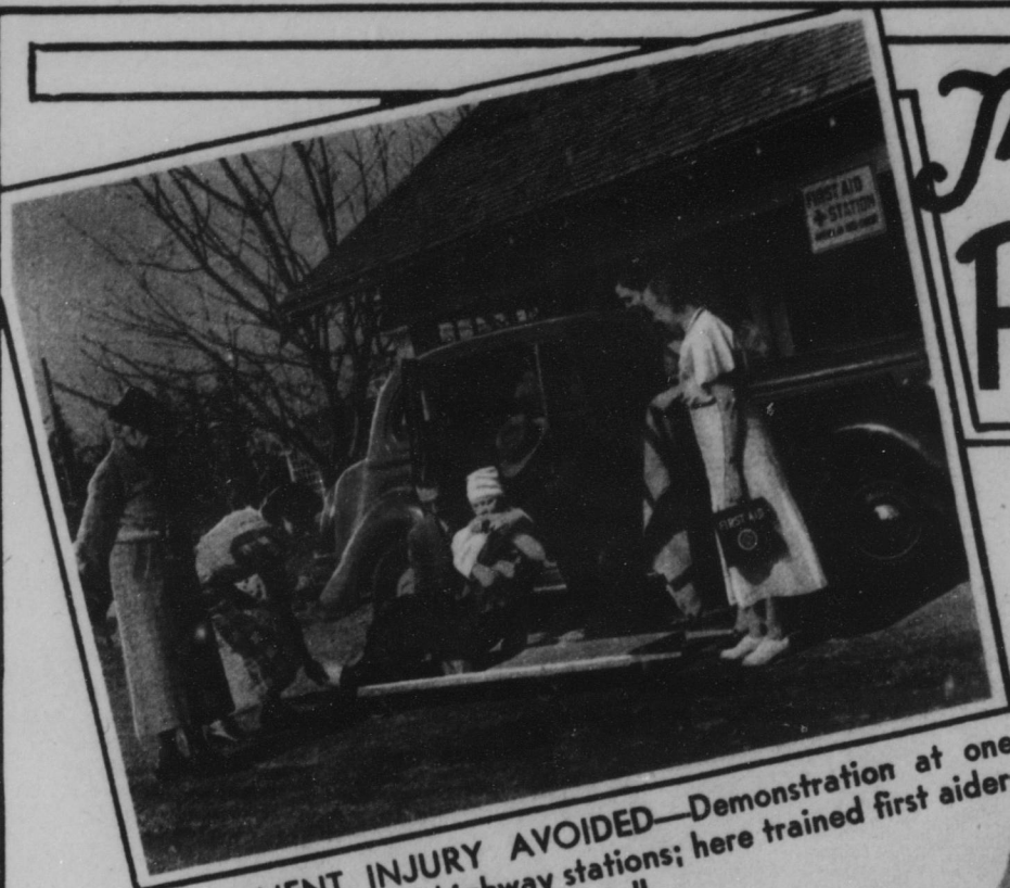
PERMANENT INJURY AVOIDED —Demonstration at one of 1,600 Red Cross highway stations; here trained first aiders help to reduce accident death toll.