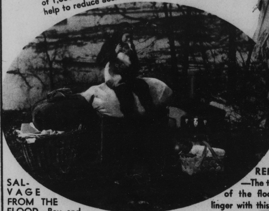
SALVAGE FROM THE FLOOD —Boy and dog view the family's worldly goods piled on river bank where Red Cross found them, provided shelter and care.