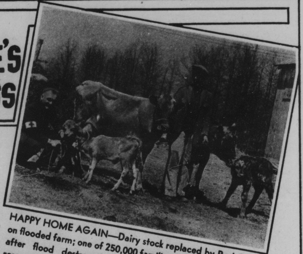
HAPPY HOME AGAIN —Dairy stock replaced by Red Cross on flooded farm; one of 250,000 families aided to self-support after flood destroyed all resources.