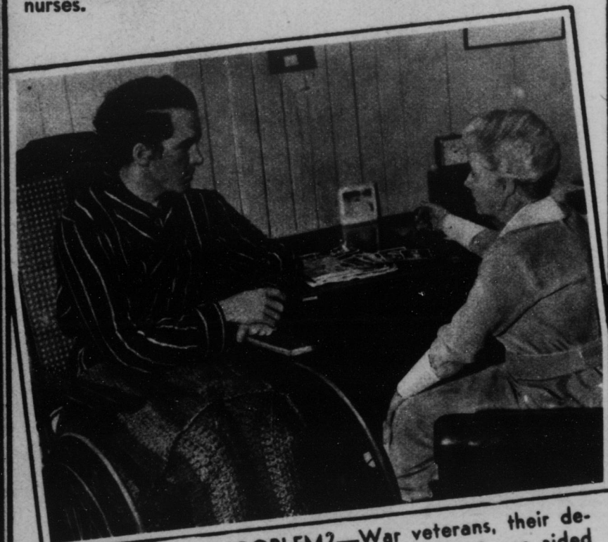
WHAT IS YOUR PROBLEM? —War veterans, their dependents, and service men, in hospital or out, are aided by Red Cross in solving their difficulties.

The Red Cross operates through 3,700 Chapters and their 9,000 Branches. Every one who joins through the local Chapter supports these services to the public.