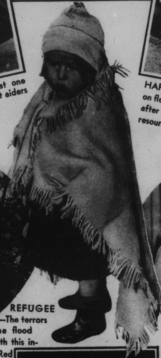
REFUGEE —The terrors of the flood linger with this infant, rescued by Red Cross.