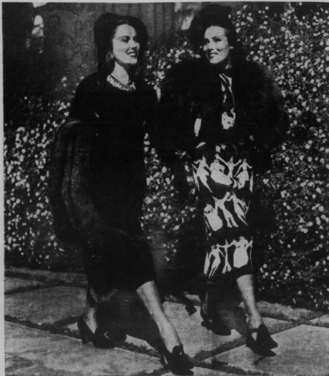
Luxury in furs, by night or day: Mary Livingstone (extreme left) presents a picture of glamour in white. And, for daytime luxury, there is Anita Louise (above). Her cape of white fox dyed to resemble lynx is set off by a black pill box hat and a beige wool dress. Then there are Fay Wray and Dolores Del Rio (left) who favor black for sunlit hours. Fay wears silver foxes around her shoulders. Dolores has a short black fox jacket which comes just to the waistline.