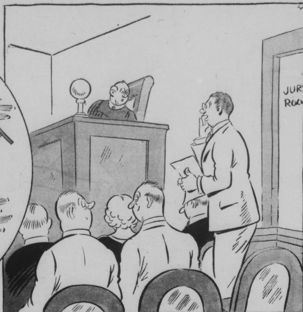
"We Find the Defendant Guilty of Selling Intoxicating Liquor? ---hic!"