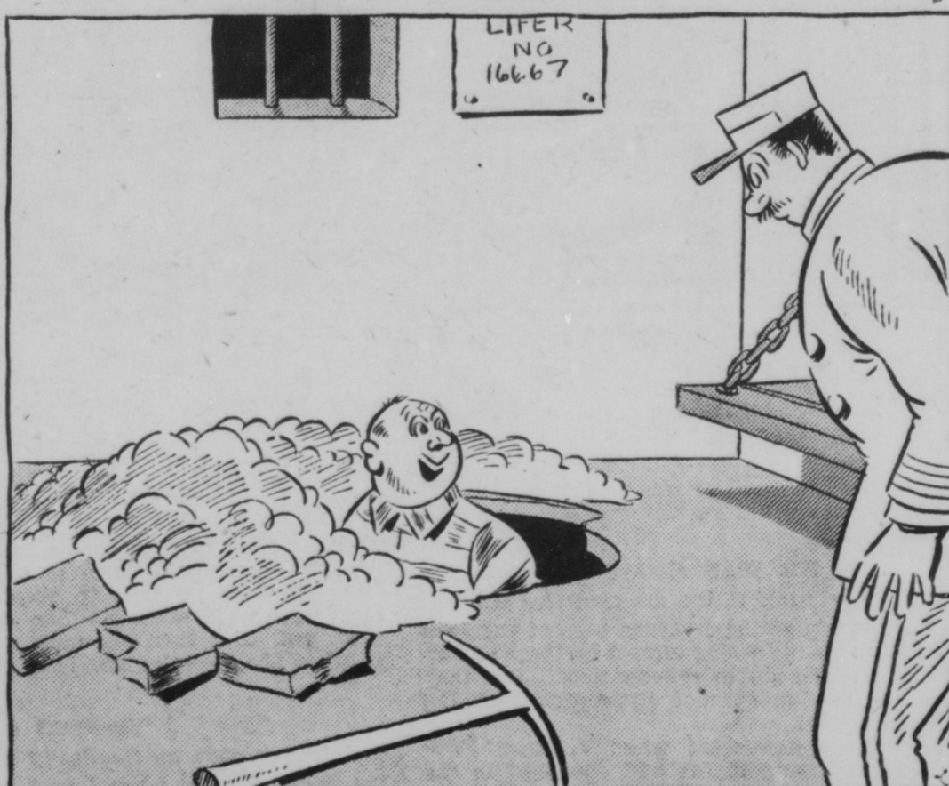
"I'm Taking a Correspondence Course in Mining and I'm Doing My Home Work."