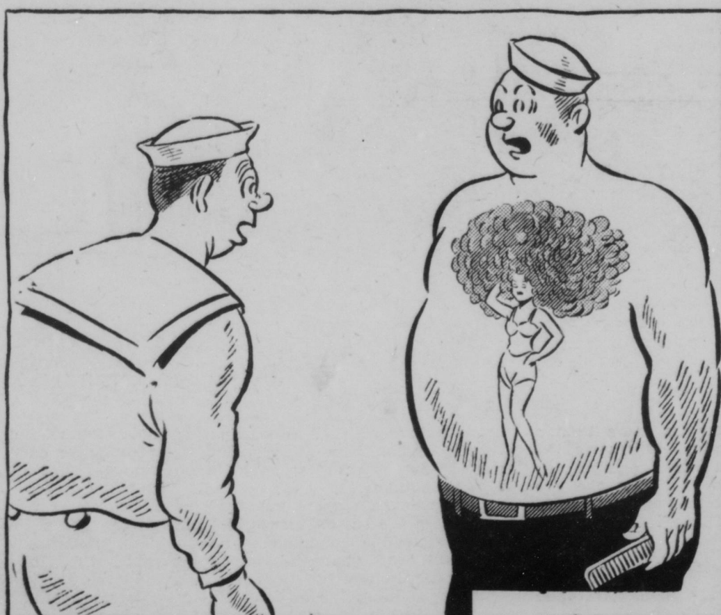
"I Just Washed Her Hair and I Can't Do a Thing With It!"