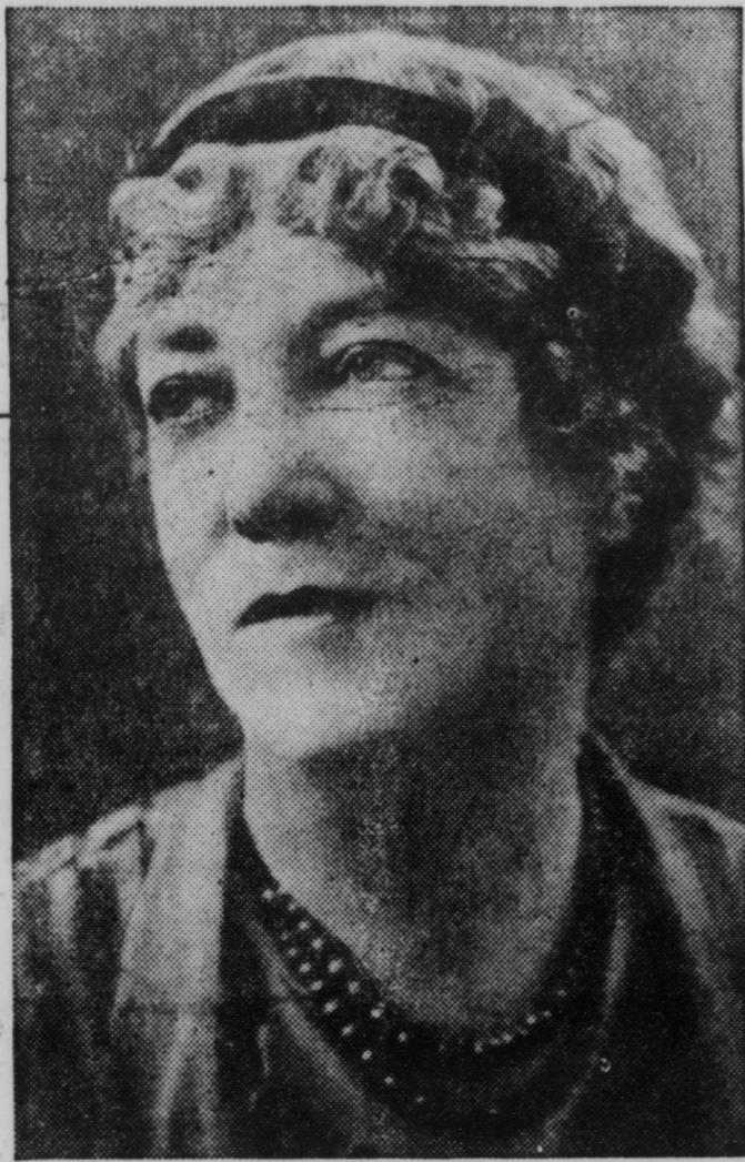
RUTH COMFORT MITCHELL'S

Only that picture is noble which is painted in love of the reality—Ruskin.