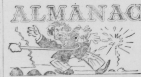
"The ripest fruit first falls" —Shakespeare

There was one visitor present at the meeting. The program begins at 7:15 and new members and visitors are always welcome.