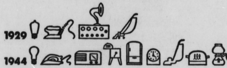
AND gets about twice as much electricity for its money as it did 15 years ago!

S TATISTICS are tricky things to toss around.