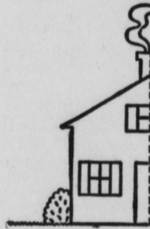
owns 1/2 of a house