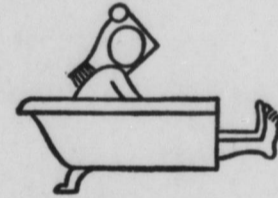
uses 1/3 of a bathtub