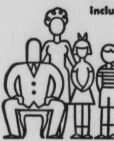
includes 3 1/2 persons