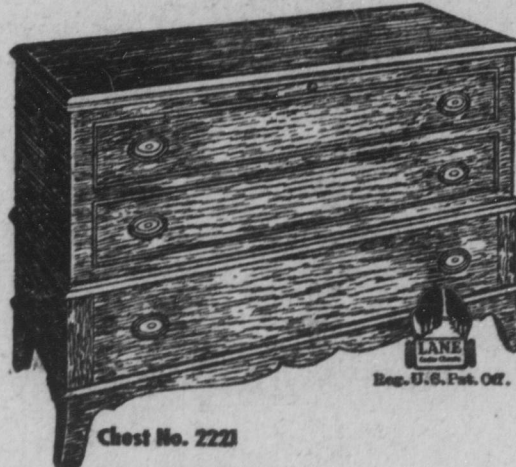
Chest No. 2221