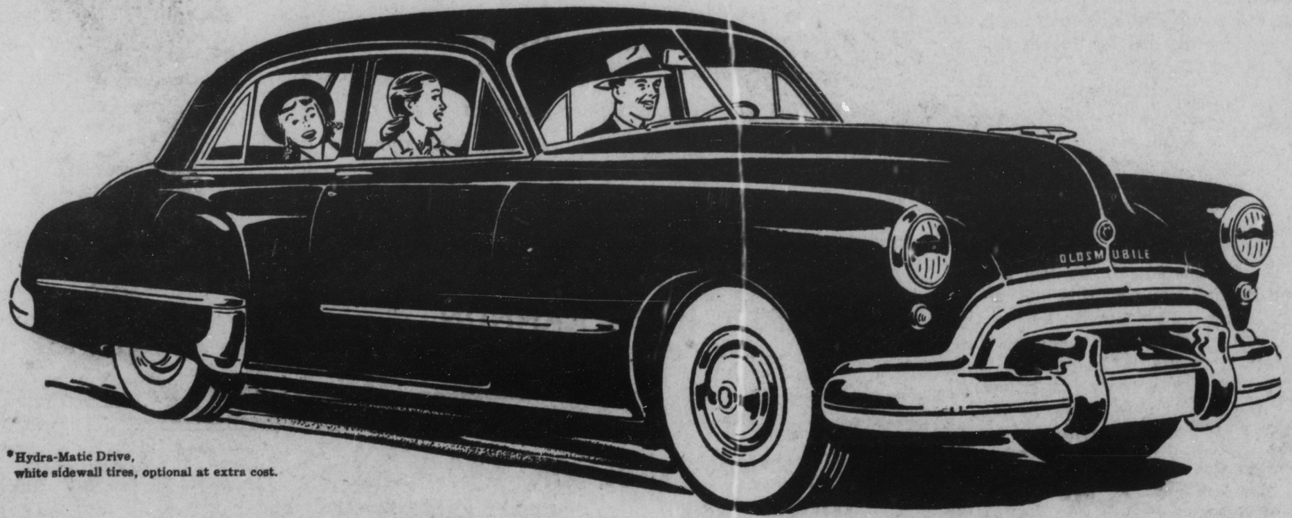
*Hydra-Matic Drive, white sidewall tires, optional at extra cost.

Here's the car that's inspired new words for "In My Merry Oldsmobile." It's the Futuramic '48, a brand new model that's leading the way into a new Golden Era of progress and advancement!