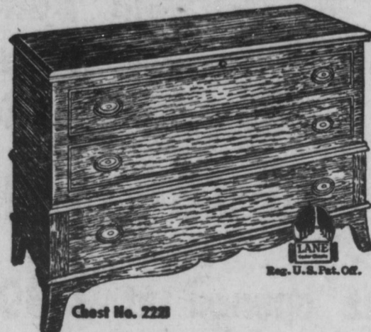
Chest No. 222

Girl grads today know what they want. Most all of them want a beautiful Lane Hope Chest. And no wonder! This romantic gift does so much to make dreams come true. Choose one of our popular Lane Cedar Chests for your girl graduate. It will have all the exclusive features that make a Lane a lifetime possession. Come in, soon.