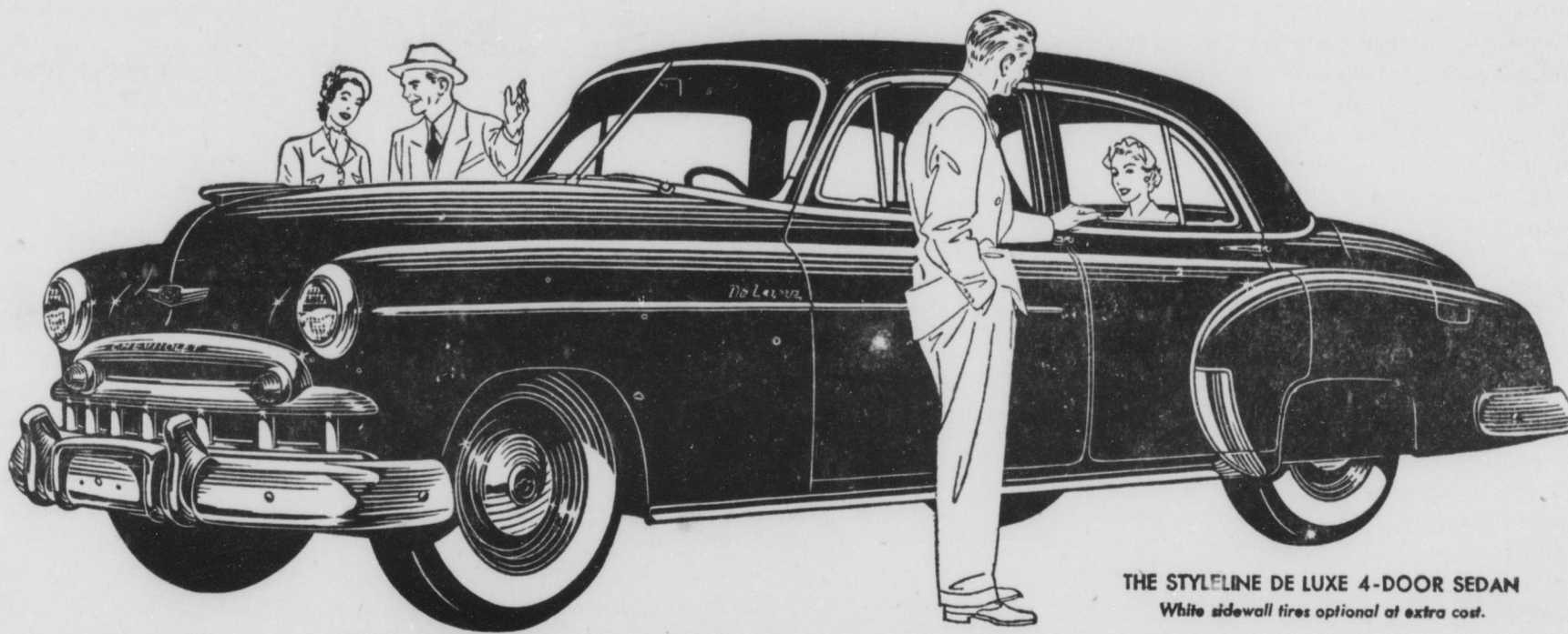
THE STYLELINE DE LUXE 4-DOOR SEDAN White sidewall tires optional at extra cost.

for full value... for a full view... and from every viewpoint