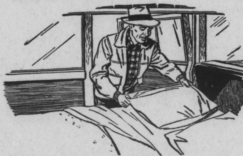
Tune In HENRY J. TAYLOR, ABC Network, every Monday evening.

MORE CLEARLY THAN EVER "Buick's The Buick"