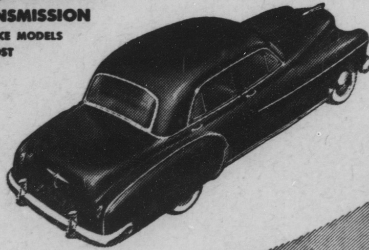
All cars shown are Styleline DeLuxe 4-Door Sedans

America's Best Seller CHEVROLET America's Best Buy