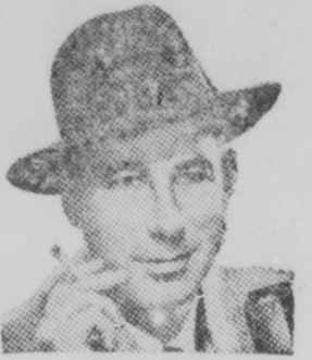
BILL STERN Popular sportscaster