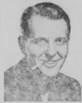
RALPH BELLAMY Stage and screen star

With Stars who must think of their throats, it's COOL, MILD