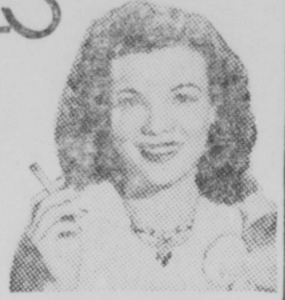
NANETTE FABRAY Musical-comedy star