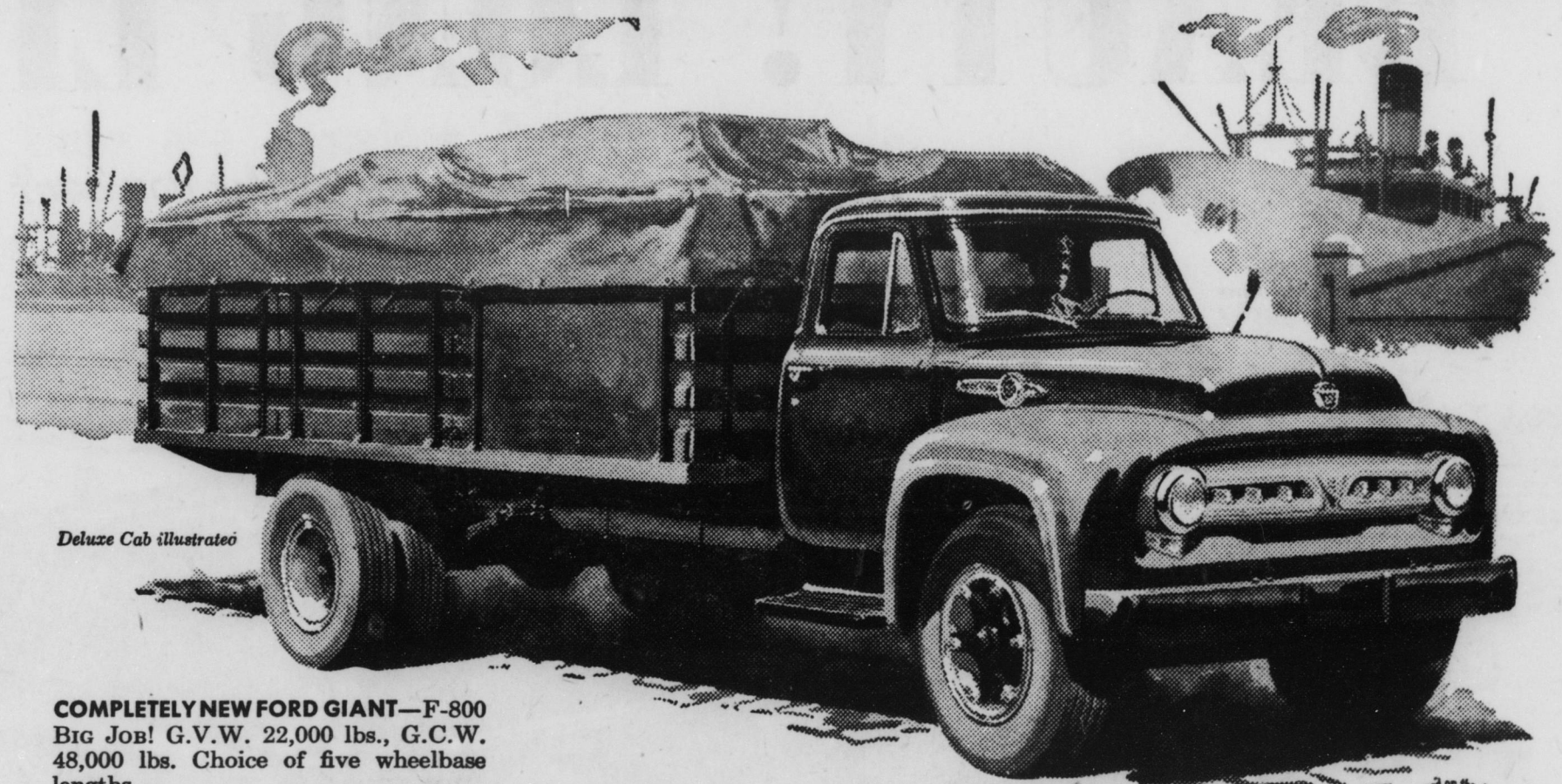
Deluxe Cab illustrated

COMPLETELY NEW FORD GIANT—F-800 BIG JOB! G.V.W. 22,000 lbs., G.C.W. 48,000 lbs. Choice of five wheelbase lengths.