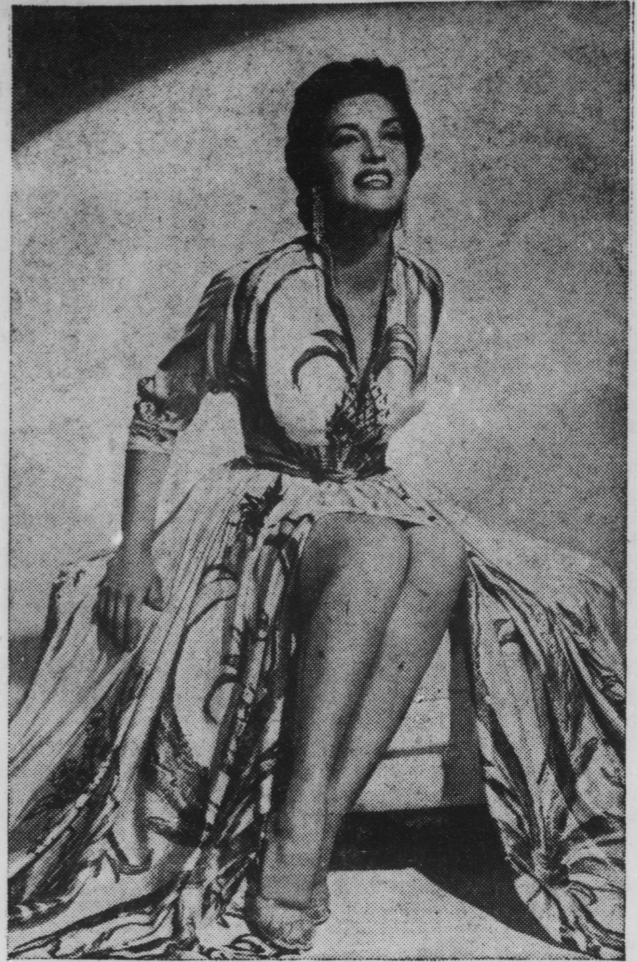
KATY JURADO, one of the real glamor girls of Mexican films shows good evidence of her great popularity. She recently completed the filming of "Trial" at the M-G-M Studio, which also features Glenn Ford, Arthur Kennedy and Dorothy McGuire.