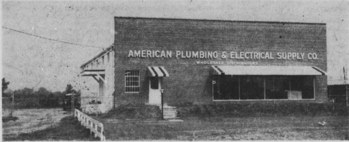
Shown above is the Goldsboro plant of the American Plumbing and Electrical Supply Co., located on South George Street Extension.