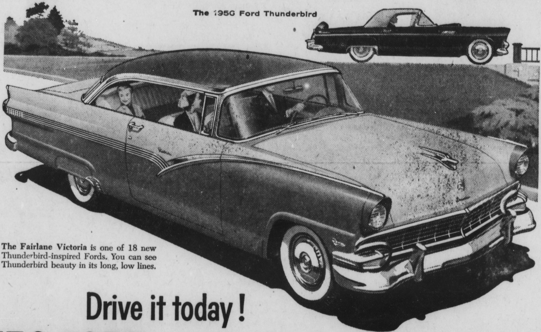
The 1956 Ford Thunderbird