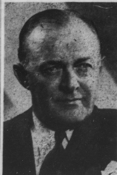
Harold D. Cooley

Congressman Harold D. Cooley, chairman of the House Agricul-