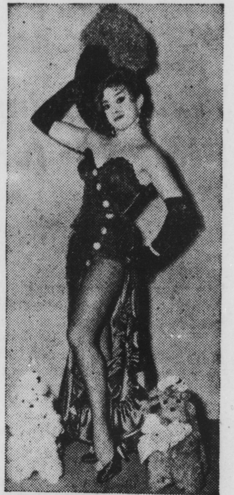
LILIANE MONTEVECCHI, petite French ballerina, who will be featured in the forthcoming M-G-M musical, "Meet Me In Las Vegas" in which she will be teamed with Cyd Charisse in a ballet version of "Frankie and Johnny."

Rhymes of the times sez . . . "If you love life, use driving speed with care, for you're not a cat with eight lives to spare."