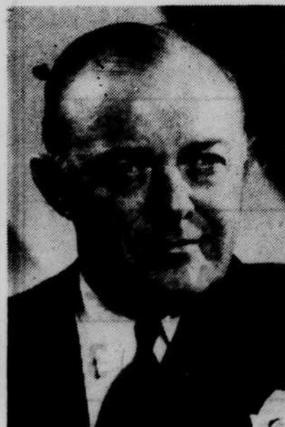
Harold D. Cooley