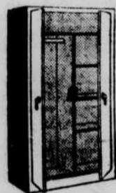
← Wardrobe and Storage Cabinet

With 3 adjustable shelves, a hat shelf and rod for coat hangers. 36" w., 76" h., 18½" d.