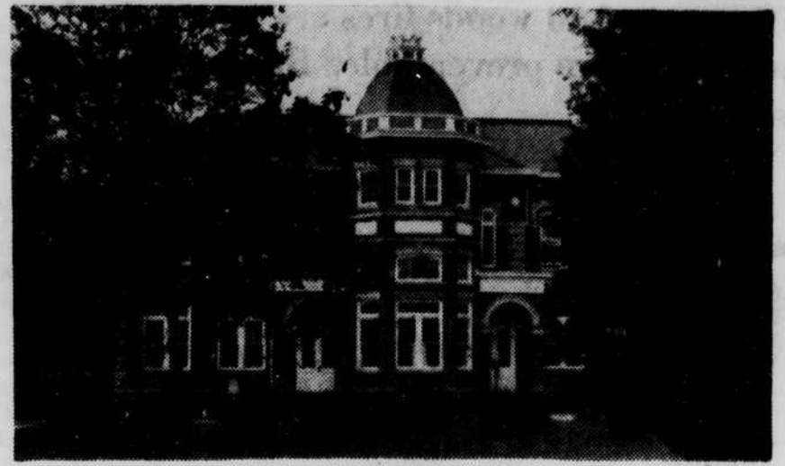
WAKELON HIGH SCHOOL

The Mayor said the Town Board will consider the applications at the September meeting next Monday night, and he "feels reasonably sure" an appointment will be made at that time.