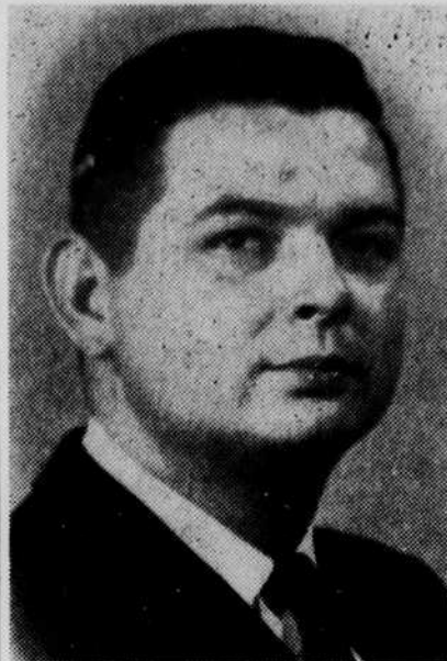
Mt. Tabor and Ellis Chapel Methodist Chapel Methodist Churches in north Durham County from 1955-59.