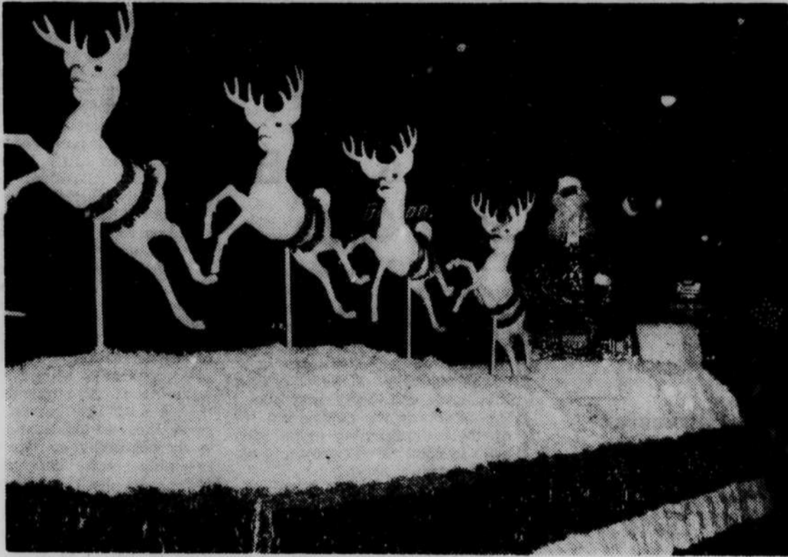
Santa Claus was greeted by some 5,000 persons when he came to Zebulon Monday night. He tossed his cherry greetings to the children and adults from his beautiful reindeer float.