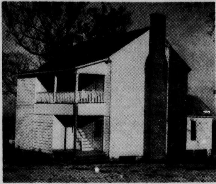
FIRST BUILDING for Louisburg College was Old Main. This building was a classical example of Greek Revival architecture.

VOLUME 36, NUMBER 47, ZEBULON, N. C., JANUARY 4, 1962