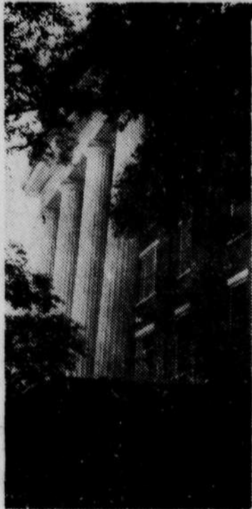
FRANKLIN ACADEMY BUILDING. Built in 1806, this building still stands, and is a historical landmark of Louisburg College.

will be a cultural highlight of the year.