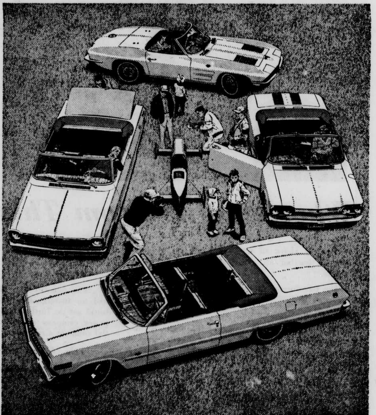
Models shown clockwise: Corvette Sting Ray Convertible, Corvair Monza Spyder Convertible, Chevrolet Impala Super Sport Convertible, Chevy II Nova 400 Super Sport Convertible. Center: Soap Box Derby Racer, built by All-American boys.

NOW SEE WHAT'S NEW AT YOUR CHEVROLET DEALER'S