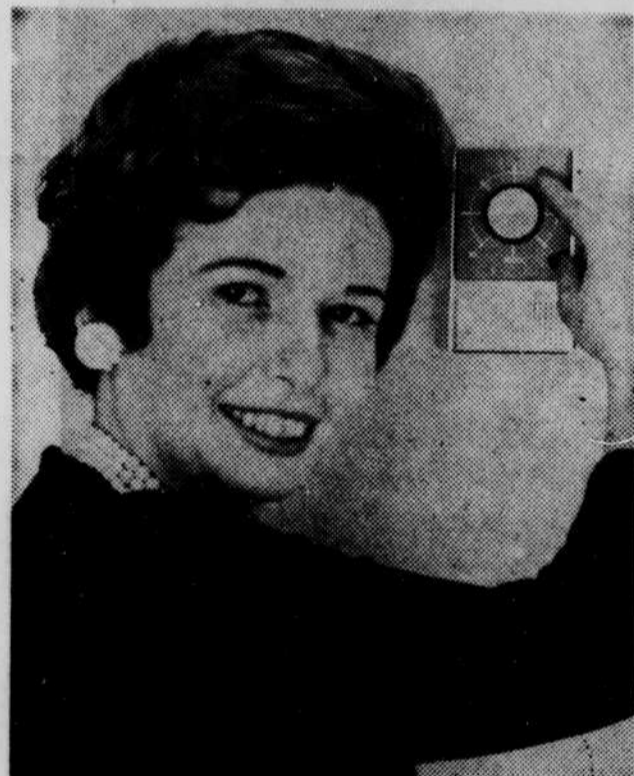
The unique advantage of flameless electric heat lies in the thermostat you see here. For bedroom, bath, or any living area, you select the individual temperature setting you prefer.

Visit this Gold Medallion Home Featuring