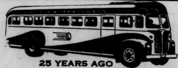
25 YEARS AGO