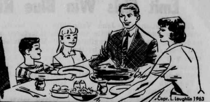
Table-Trimmed MEATS at Budget-Trimming PRICES

PORK CHOPS End Cuts 45c lb. Center Cuts 59c lb.