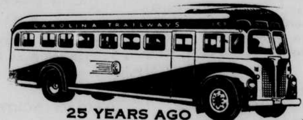
25 YEARS AGO