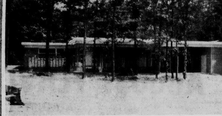
Gold Medallion Home built by Bridges Construction Co. lectrical Contractor: Garner Electric Science