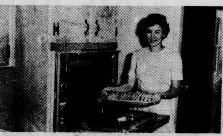
Another modern feature designed to save you time, steps and effort is this flameless total-electric kitchen.