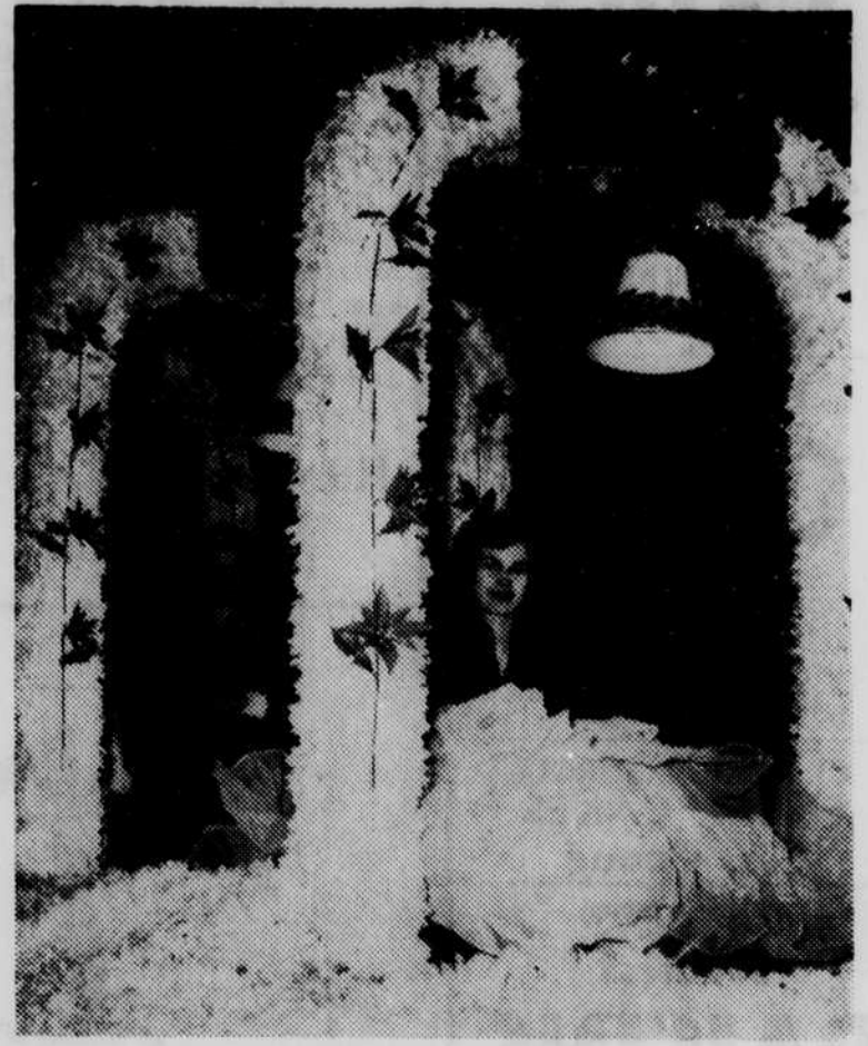
Pretty girls on floats