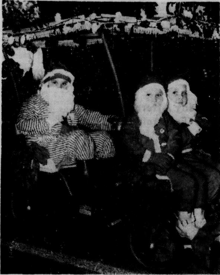
Tiny Santas add joy