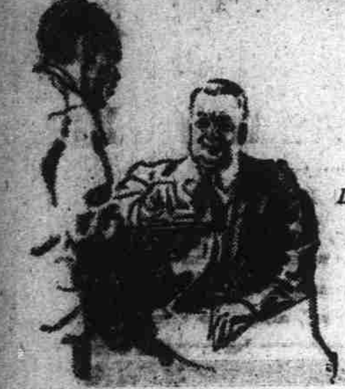
Let Fatima smokers tell you

—and after all, what other cigarette is so highly respected by so many men?