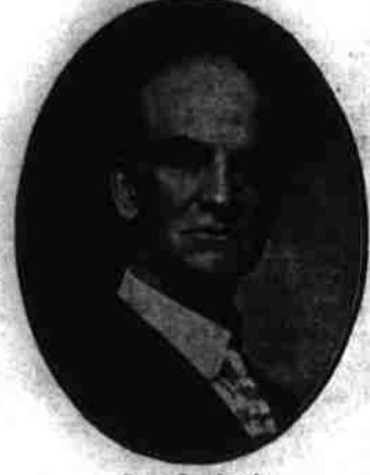
Front & Late Snapshat

OF GREENSBORO, N. C. One Day Only-Consultation and Examination Confidential, Invited and PREE.