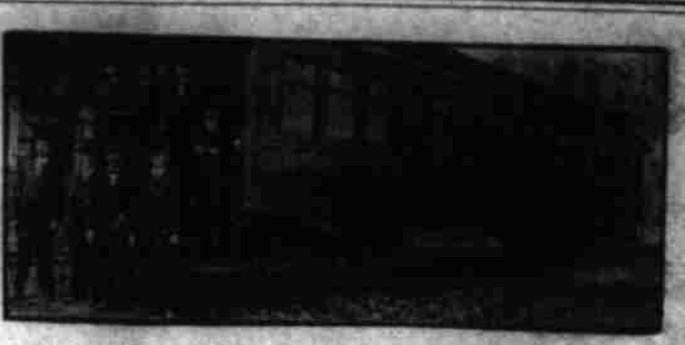
Southern Railway Cotton Culture Department.

TO CURE A COLD IN ONE DAY. Take LAXATIVE BROMO Quinine Tablets. Druggists refund your money if it fails to cure.