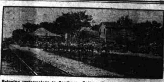
Bringing watermelons to Southern Railway Depot, Clayton, N. C.