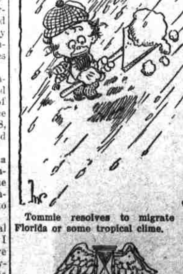
Tommy resolves to migrate to Florida or some tropical clime.