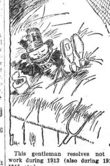
This gentleman resolves not to work during 1913 (also during 1914, 1915, etc.)