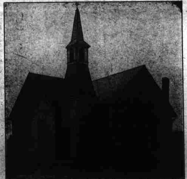
Trinity Reformed Church, Concord.

Germs Far More Destructive Than Generals.—But Bear's Emulsion Tones Up System and Tends to Prevent Tuberculosis. Civil War Deaths, 1861 to 1865, 265,000. Consumption, 1904 to 1907, 640,000. Would it not be a sad time in your home if your husband, wife, daughter and son would have to march out today in another civil war? They are facing an army that is far more destructive in his attack than Jackson or Lee ever were. This officer waits until you are down and then jumps on. The quiet way these attacks are made is awful. What are you going to do about it? Let it go from day to day? Or are you going to build up your system, that is weakening away and exposing you to this consumption germ? Bear's Emulsion is by far the most effective remedy to ward off this germ with. For it not only maintains normal conditions of nutrition, but has a well defined specific palliative influence upon the symptom of the germ. Another special advantage which gives the remedy the preference is that it is invariably beneficial to the disordered digestive organ. For disturbances are almost constantly present. In this way as in many others Bear's Emulsion proves to be better than any other remedy sold. One dollar a bottle or six bottles for five dollars. Express paid if you can't get it from your druggist. Sold by Gibson Drug Store. adv.