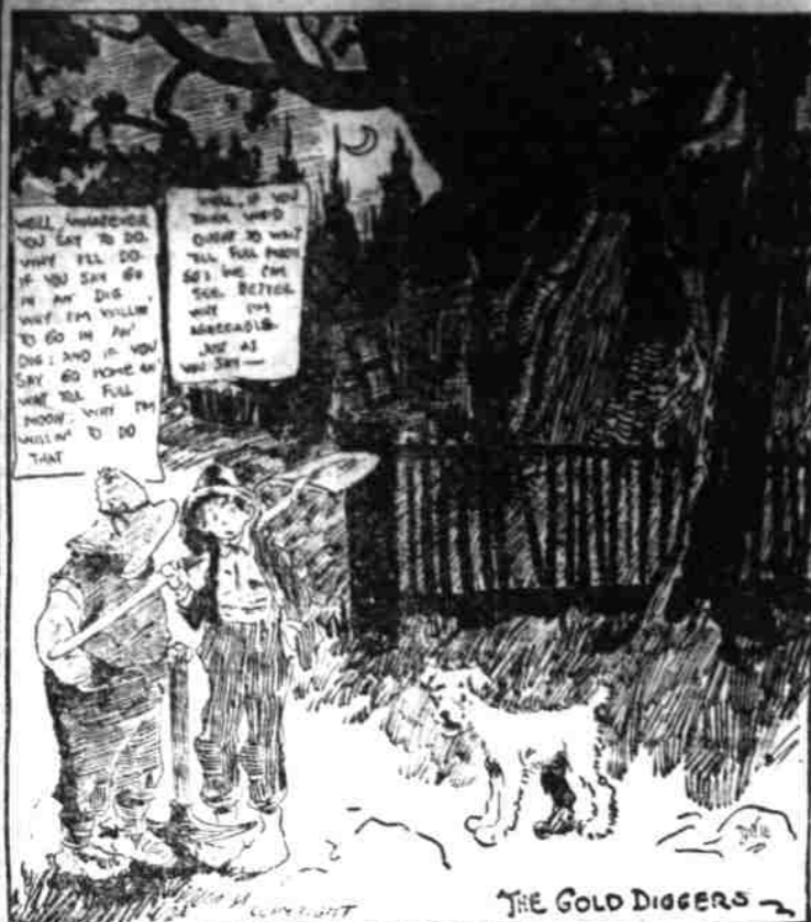
THE GOLD DIGGERS