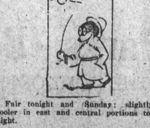
Fair tonight and Sunday; slightly cooler in east and central portions tonight.