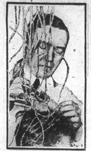
Girls take a good look at this! It shows one reason why fond mamas raise their boys to be soldiers. This lad, the top of whose head you see, is having a permanent wave put in his hair—said to be the very latest in New York!