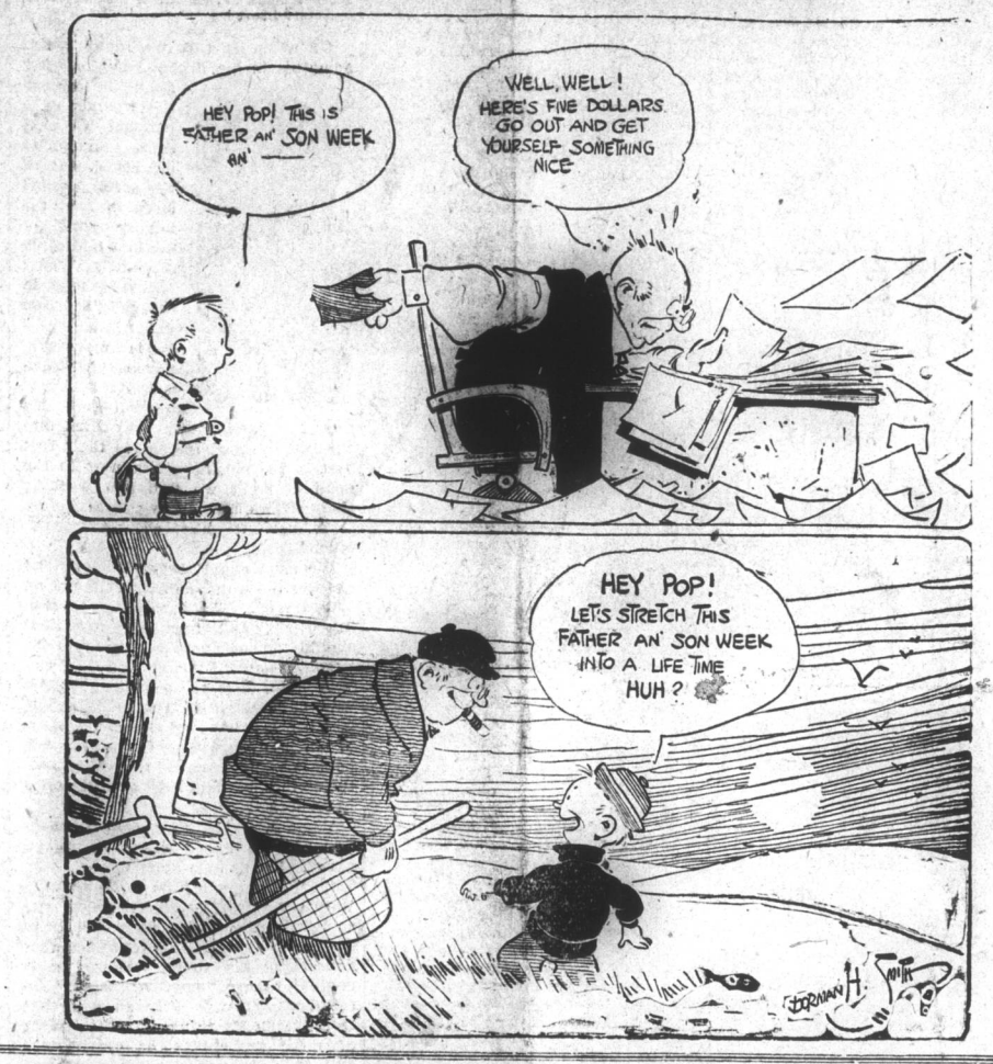
HEY POP! THIS IS FATHER AN' SON WEEK AN'— WELL, WELL! HERE'S FIVE DOLLARS GO OUT AND GET YOURSELF SOMETHING NICE. HEY POP! LET'S STRETCH THIS FATHER AN' SON WEEK INTO A LIFE TIME HUH?