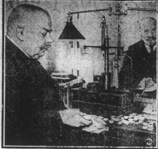
Photo shows an official of the Reichsbank in Berlin co resources of the institution. Formerly more than one for the job-but not now!