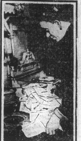
German housewives have money to burn. Marks are so worthless, the women use 'em to light kitchen fires. Several million marks are being used by this woman to get breakfast hot.