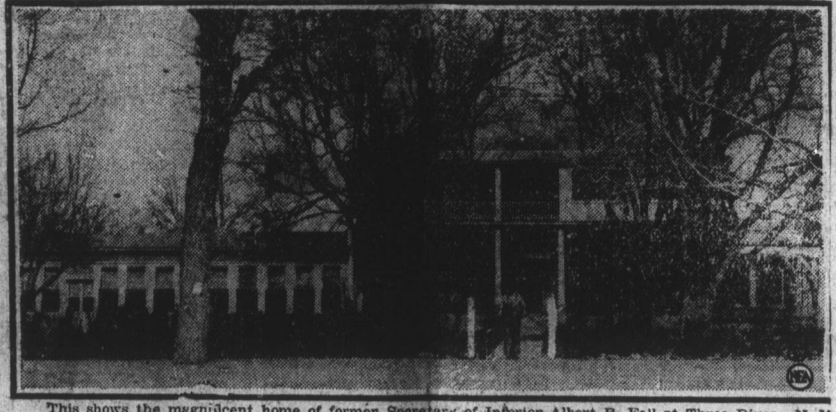
This shows the magnificent home of former Secretary of Interior Albert B. Fall at Three Rivers, N. M. In the foreground may be seen a Mexican farm-hand and a German police dog. The dog belongs to Fall.