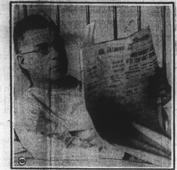
Senator Frank L. Greene of Vermont at home after leaving the hospital where he was taken Feb. 19 with a bullet wound in the hand. The senator was shot by a stray bullet fired during a battle between bootleggers and prohibition agents just off Pennsylvania avenue, Washington, D. C.