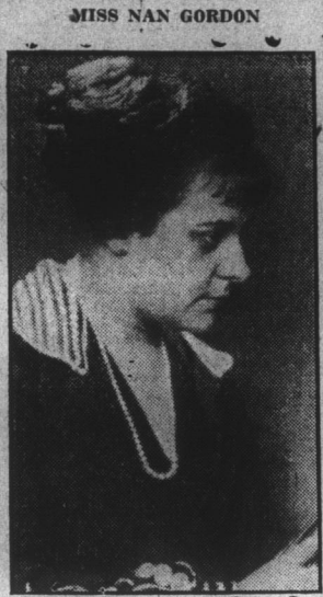
Head of Gordon Music Academy, Students of which will give concert at Central Graded School this evening at eight o'clock.

Finds False Bottom in Vehicle That Is Used by a Train. Washington, Pa., April 1.—Most of the village of Eighty-Four, a hamlet along the Baltimore & Ohio Railroad eight miles east of here, went on a spree today when a big "furniture" van was wrecked by an eastbound passenger train and 55 gallons of choice moonshine were tossed into a ditch. Residents of the vicinity of the accident, insisting that furniture was within the truck, were apparently loaded with not the only merchandise, bored holes