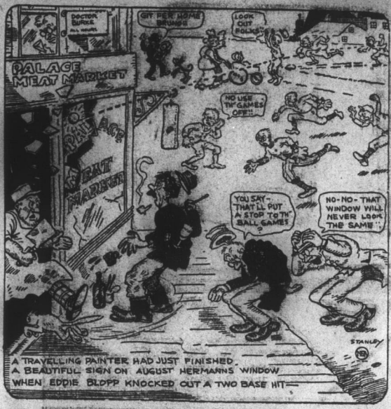
A TRAVELLING PAINTER HAD JUST FINISHED A BEAUTIFUL SIGN ON AUGUST HERMANS WINDOW WHEN EDDIE BLOPP KNOCKED OUT A TWO BASE HIT